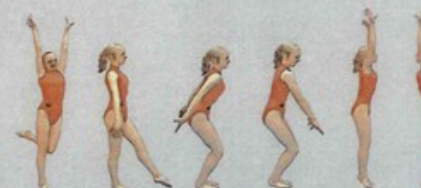
10. Chasse steps 180 degrees Good shape, bodyline and extension must be shown.