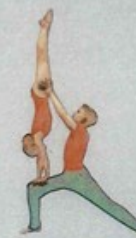
4. Base in lunge. Top handstand on knee Base shows strong lunge, back leg straight supports Top with one hand. Top straight and in balance.