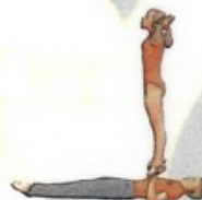
7. Base lies on floor, Top on Base's hands