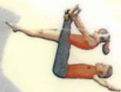
5. Base lying on floor with leg raised, Top in angel position supported on feet of Base