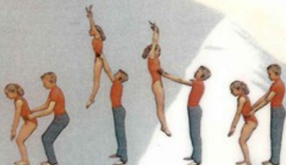
9. Supported jump full turn Hips of the Top should reach shoulder height of Base.